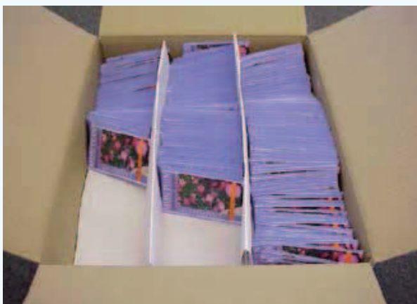
Box with sturdy separators and dividers

Full boxes must be manageable and must comply with Dutch Industrial Health and Safety standards. Boxes must not be dented or damaged.