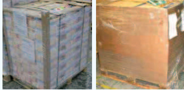
Pallet with shrink film and corner protection